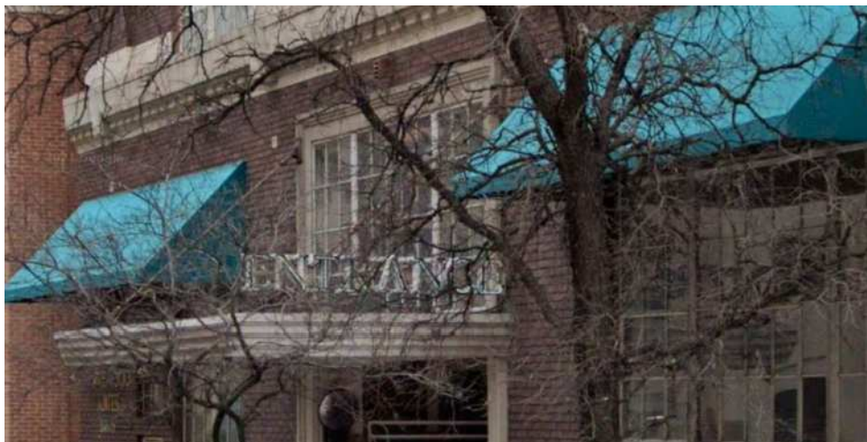
EXISTING: ENTRANCE CANOPY LETTERS 105" WIDE CANOPY