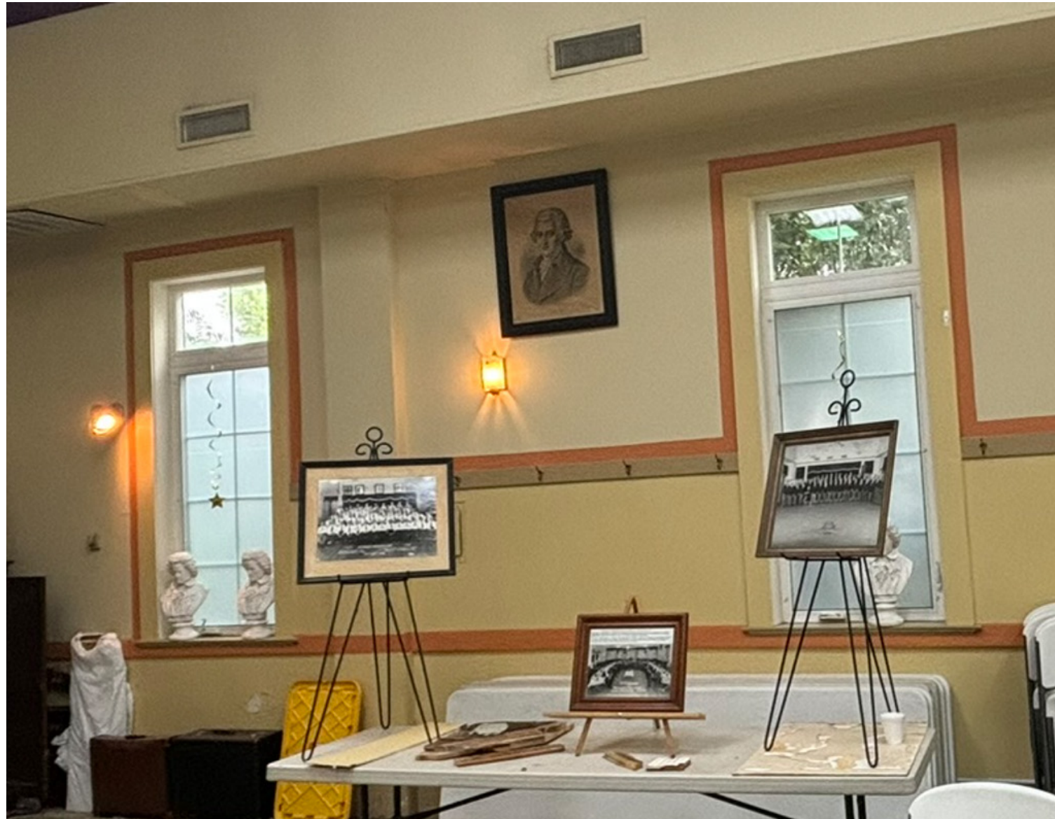
We are requesting replacement of the existing non-original 1980's or 1990's casement windows. We are requesting no change to any of the opening sizes.