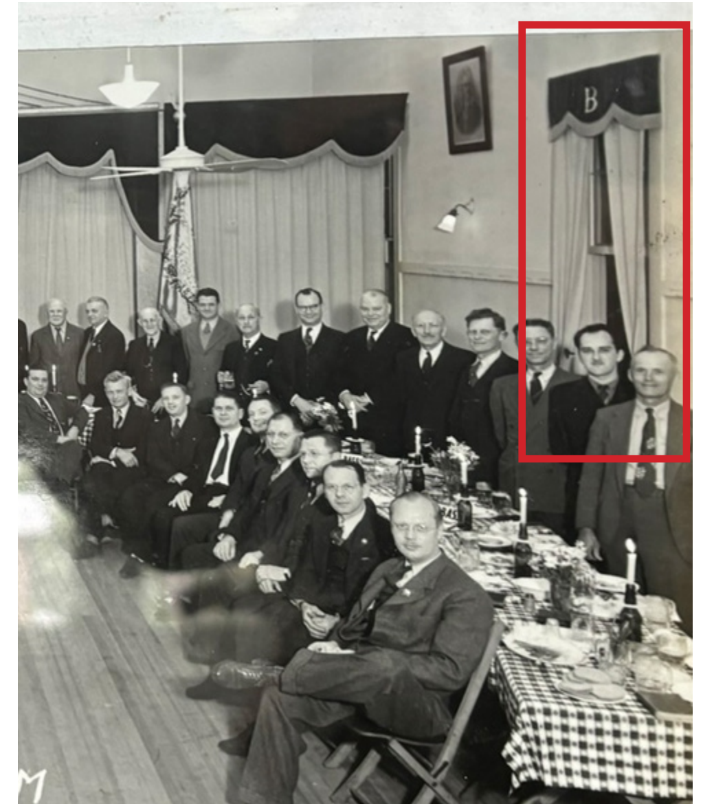
Photo from 1942 shows what appear to be the original double hung windows.