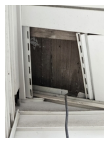
Location: Exterior of Guest Room (soffit) Notes: -Gap in siding has exposed wooden eaves -Pest intrusion concern

Location: Front face of house Notes: -Storm damage has ripped top vinyl panel & moulding off. -Exposure to outside conditions has deteriorated wood -Original wood lap siding exposed.