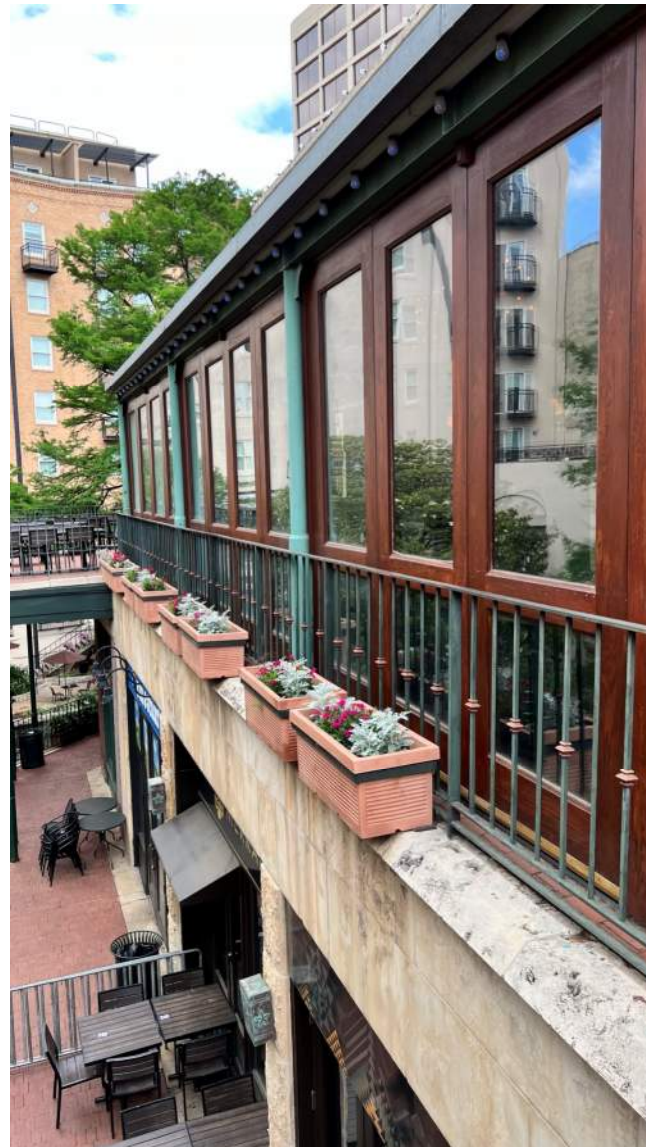
Howl at the Moon patio