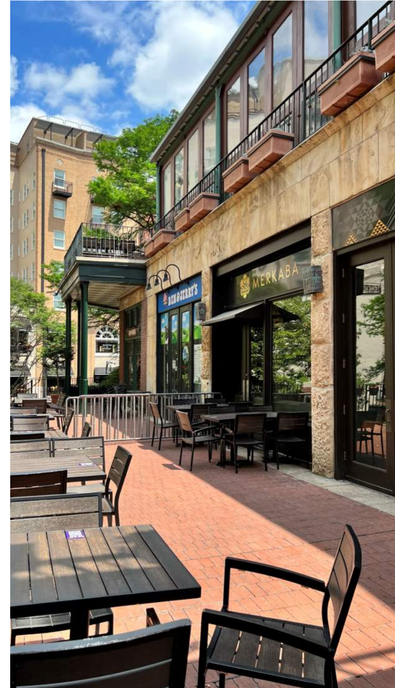
111 W. Crockett St