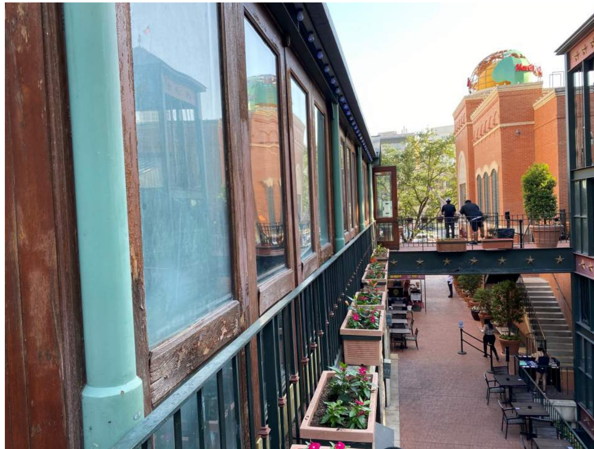
View towards W Crockett st