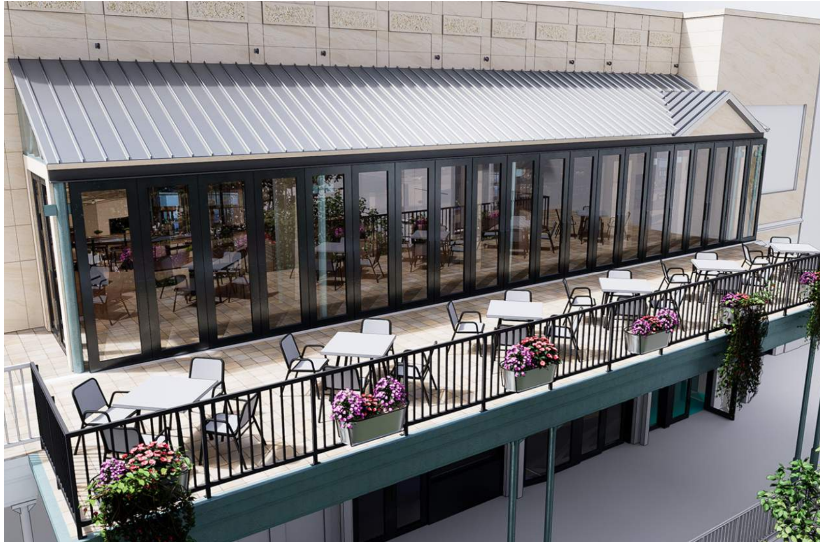
View 3-new balcony/patio and street level walk