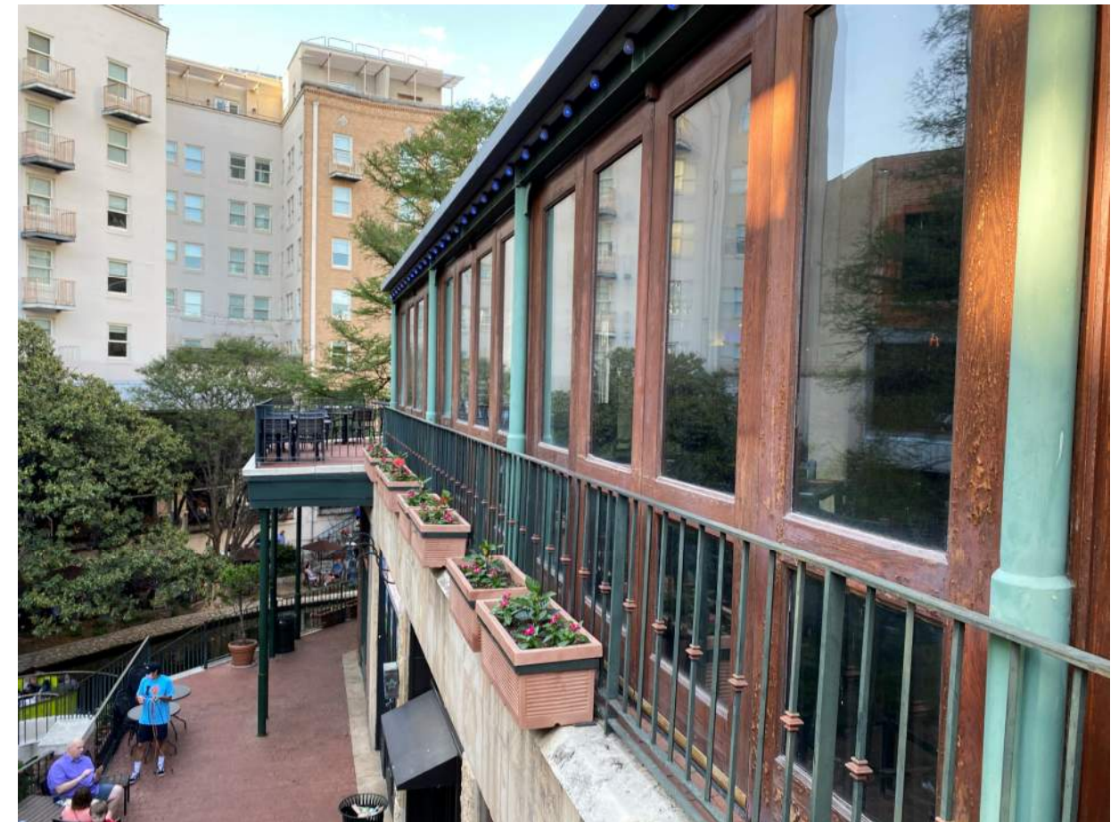
View towards Riverwalk