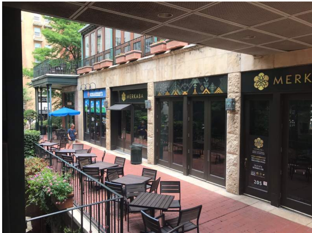
Howl at the Moon -Balcony