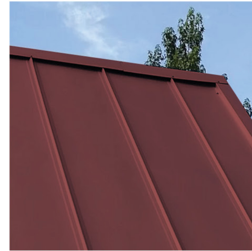
STANDING SEAM METAL ROOF COLOR: RED