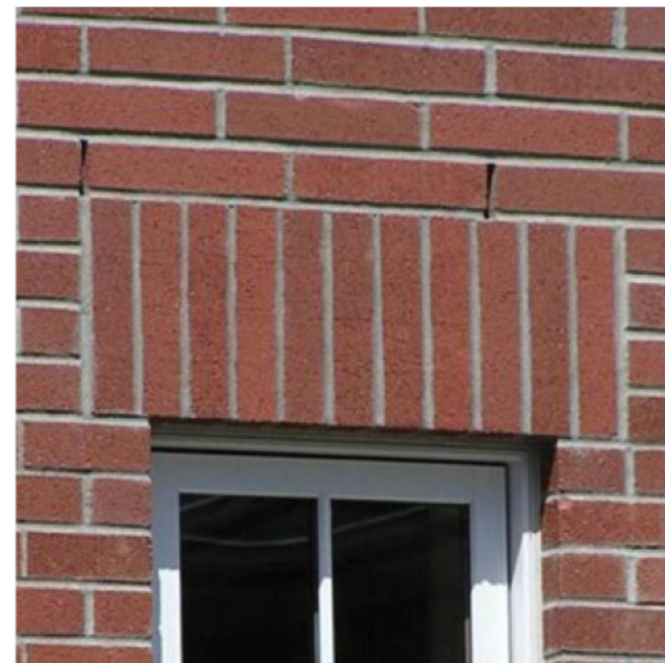
SOLDIER COURSE AT WINDOW HEAD, U.N.O. (ACTUAL COLOR NOT REPRESENTED)