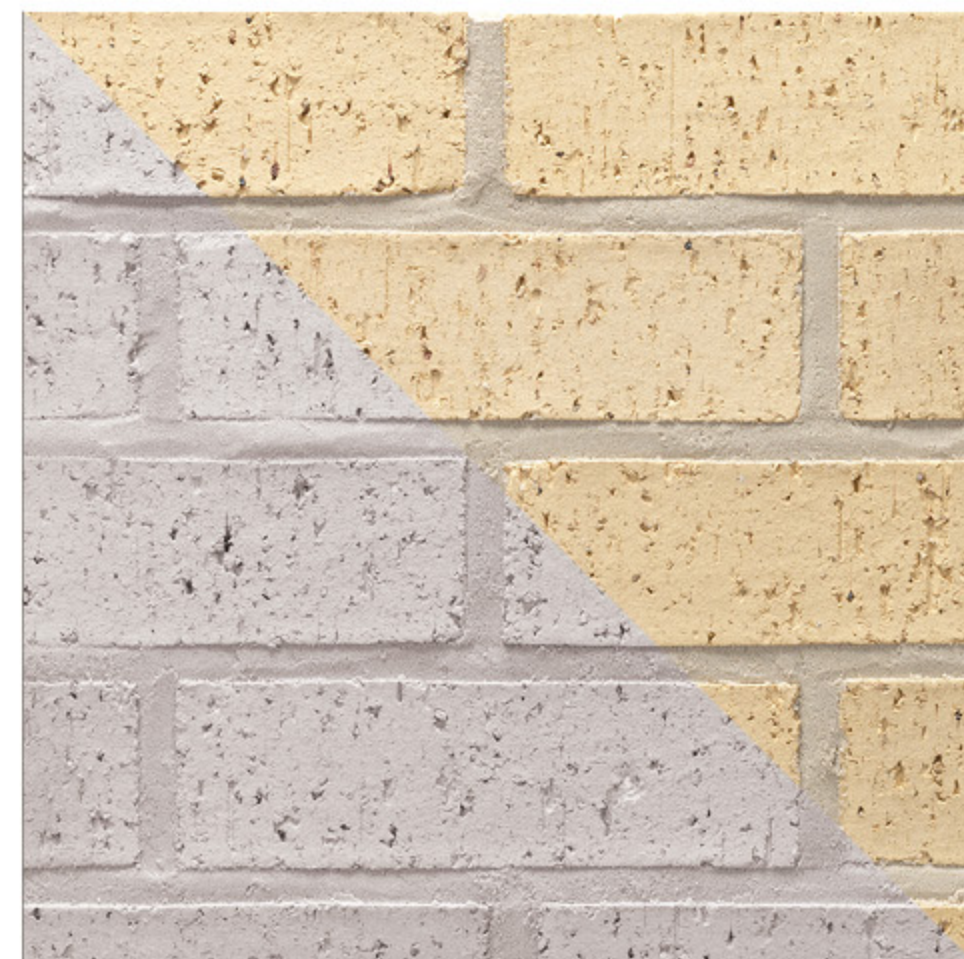
FB1P - SIERRA, ACME BRICK (PAINTED)