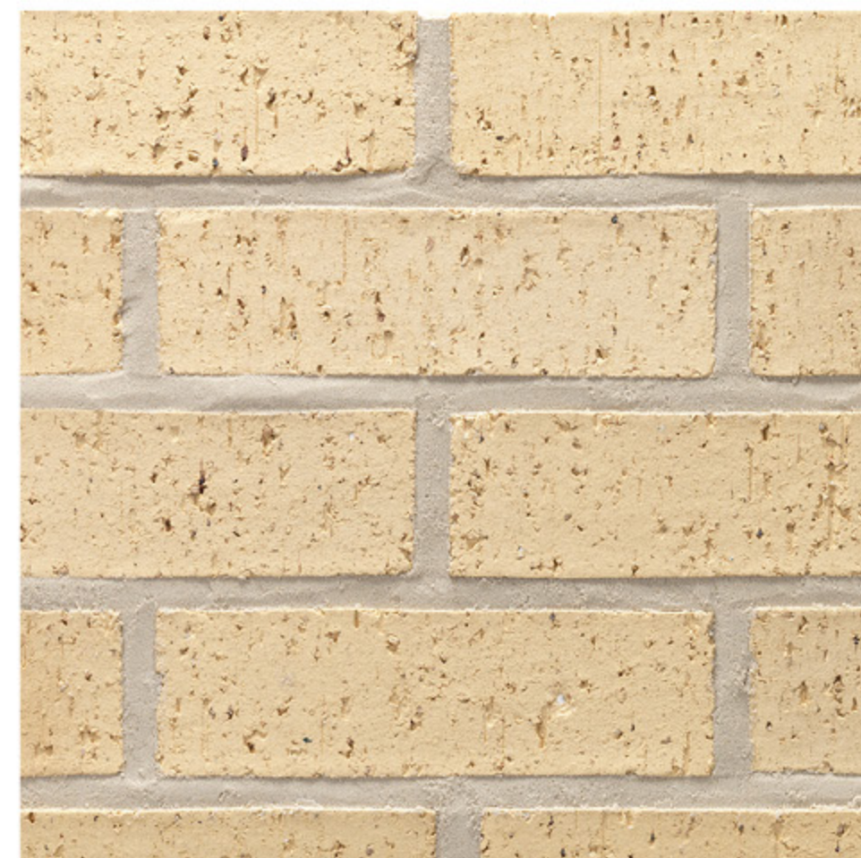
FB1 - SIERRA, ACME BRICK