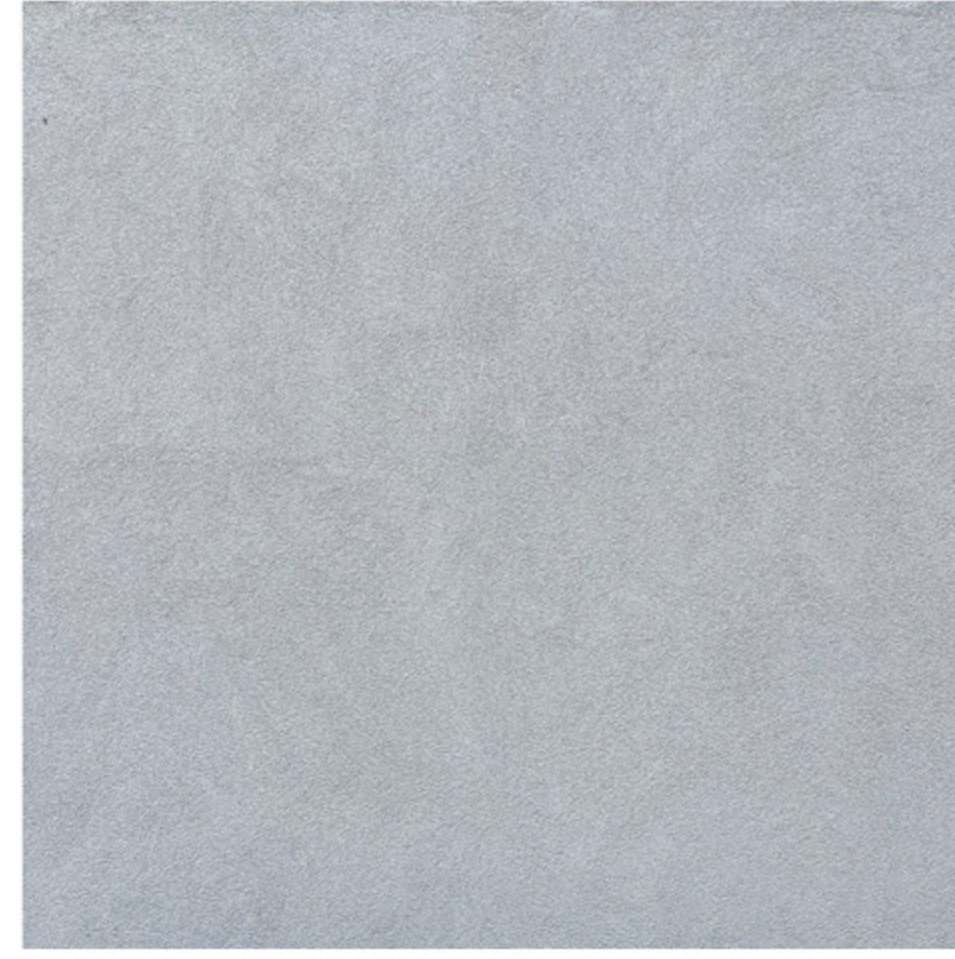
STUCCO - SMOOTH FINISH (ACTUAL COLOR NOT REPRESENTED)