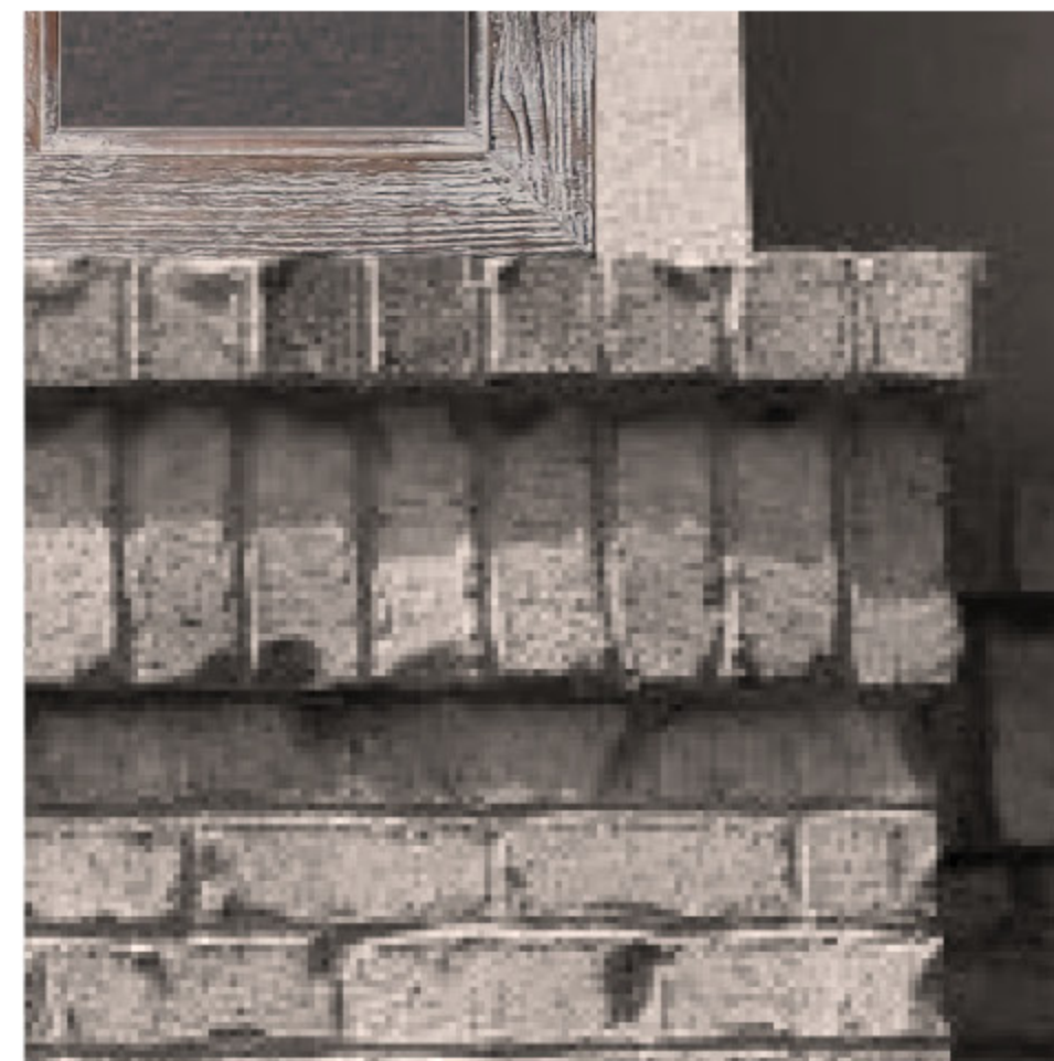
ROWLOCK COURSE AT WINDOW SILL, U.N.O. SAW CUT SOLDIER COURSE BELOW ROWLOCK