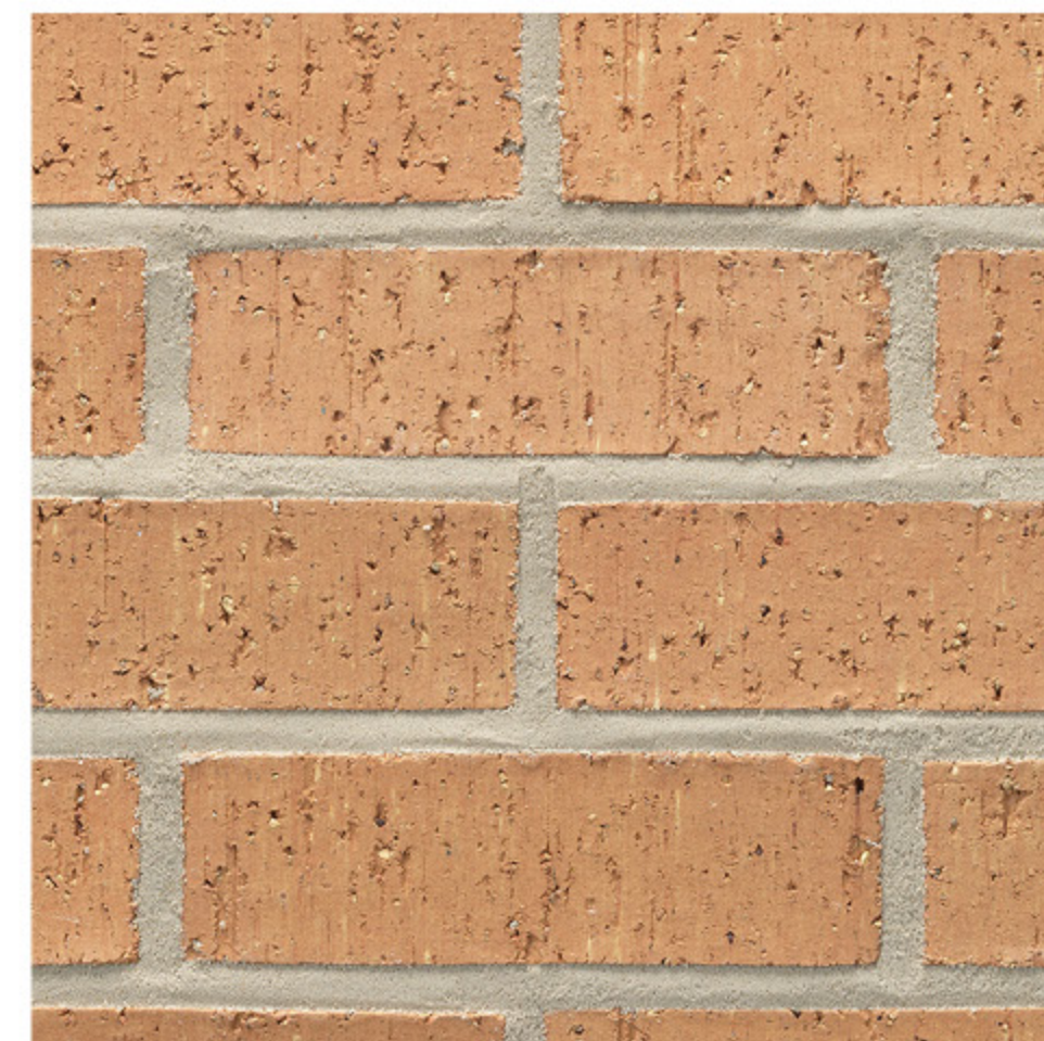
FB2 - SAGE BRUSH, ACME BRICK