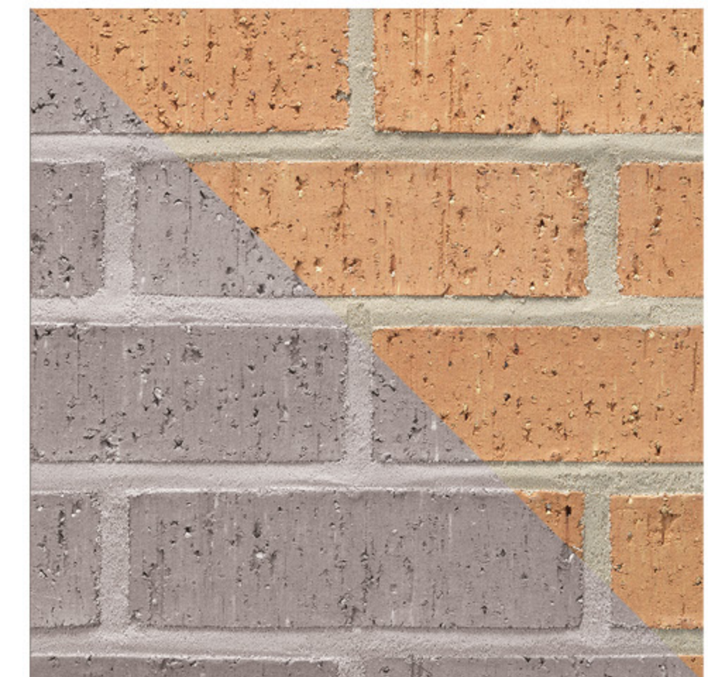
FB2P - SAGE BRUSH, ACME BRICK (PAINTED)