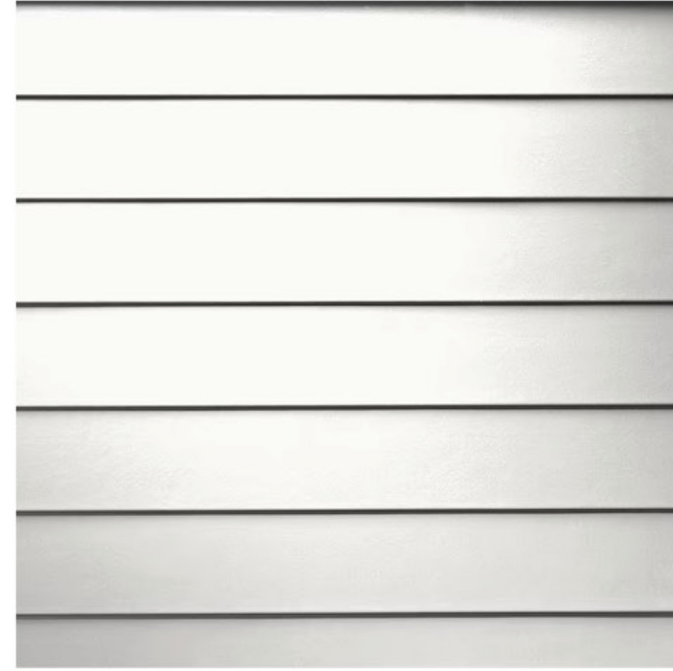
LAP SIDING - 4" REVEAL (ACTUAL COLOR NOT REPRESENTED)