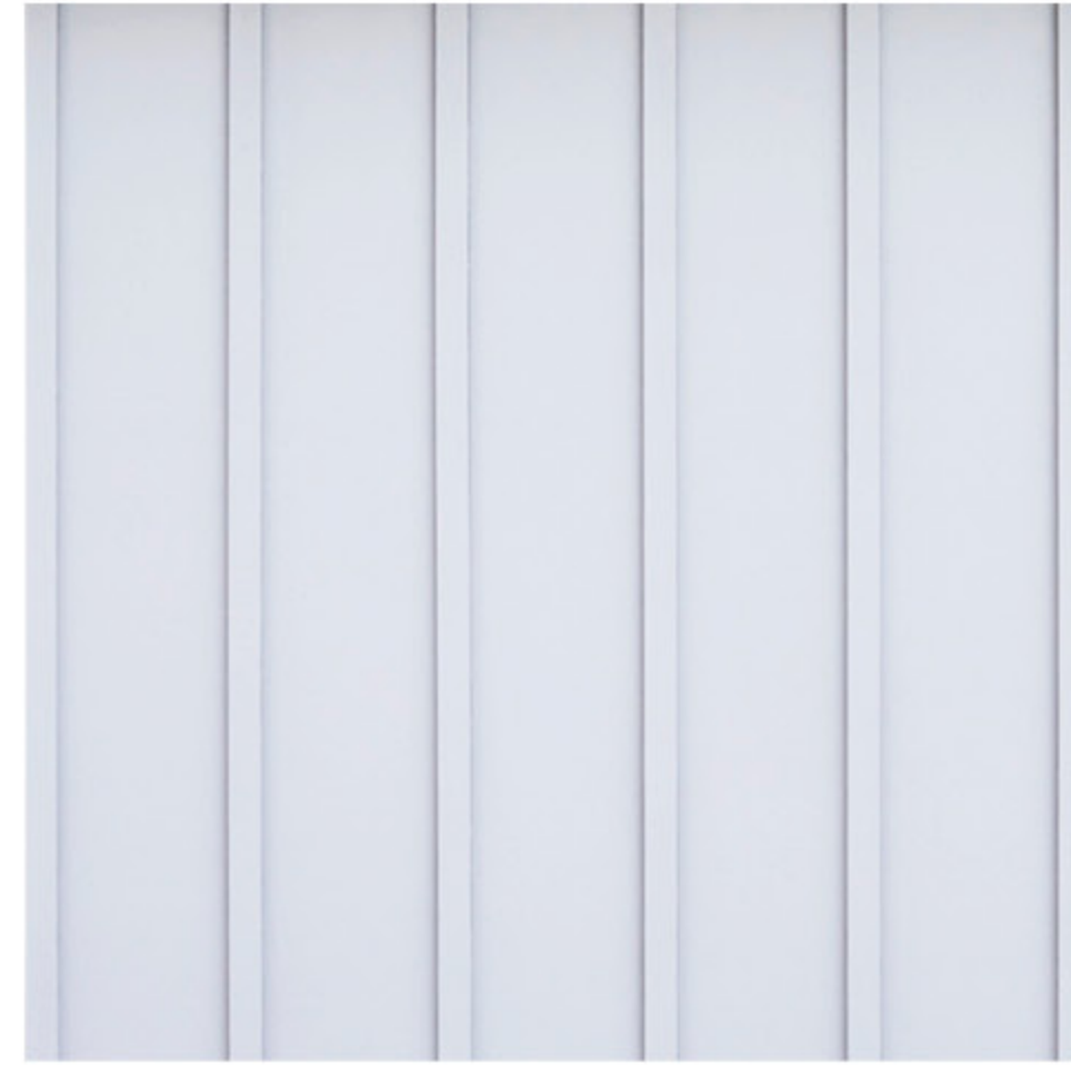
BOARD & BATTEN (ACTUAL COLOR NOT REPRESENTED)