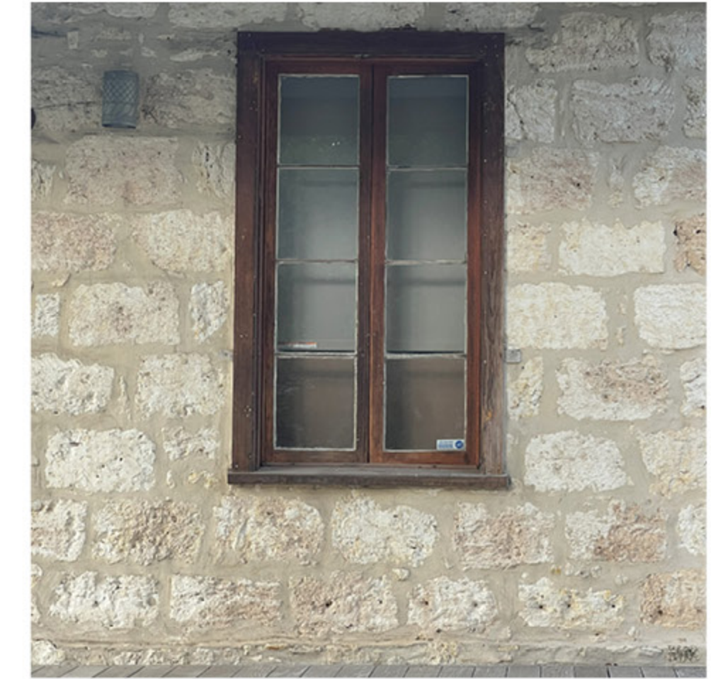
STONE - FLEMISH STYLE (CHOPPED LIMESTONE UNITS WITH "GERMAN SMEAR" MORTAR JOINTS)