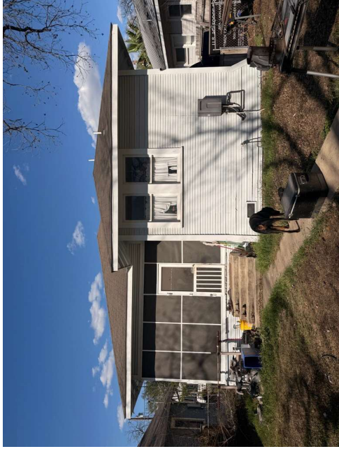
EXISTING PRIMARY STRUCTURE