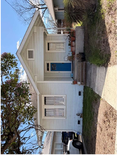
EXISTING PRIMARY STRUCTURE