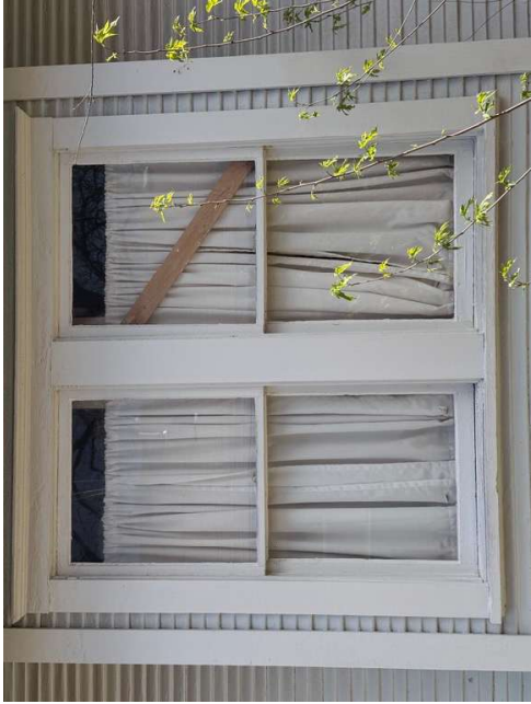
EXISTING PRIMARY STRUCTURE