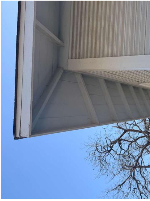
EXISTING PRIMARY STRUCTURE