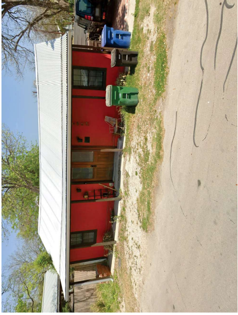
438 DEVINE ST