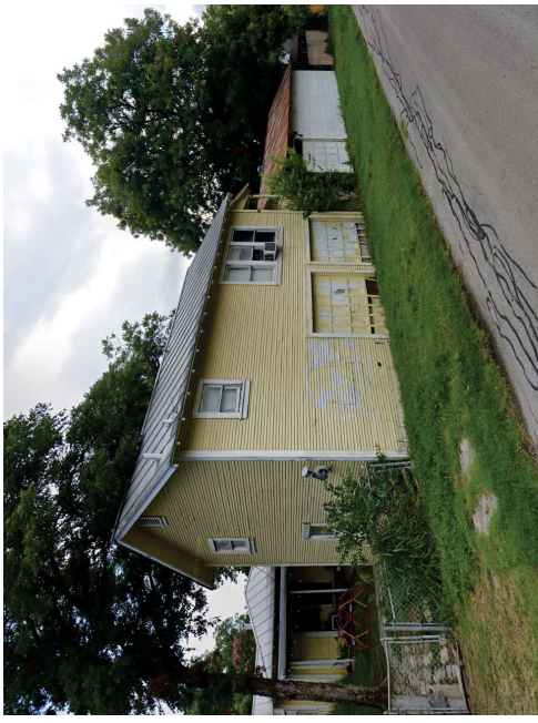
520 + 522 DEVINE ST