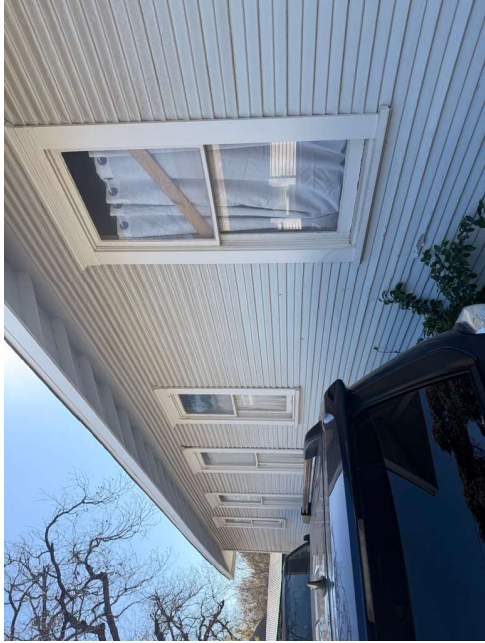
EXISTING PRIMARY STRUCTURE