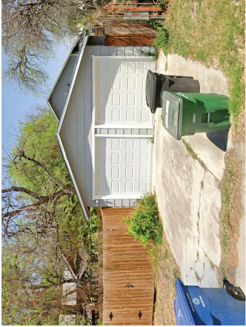
420 DEVINE ST