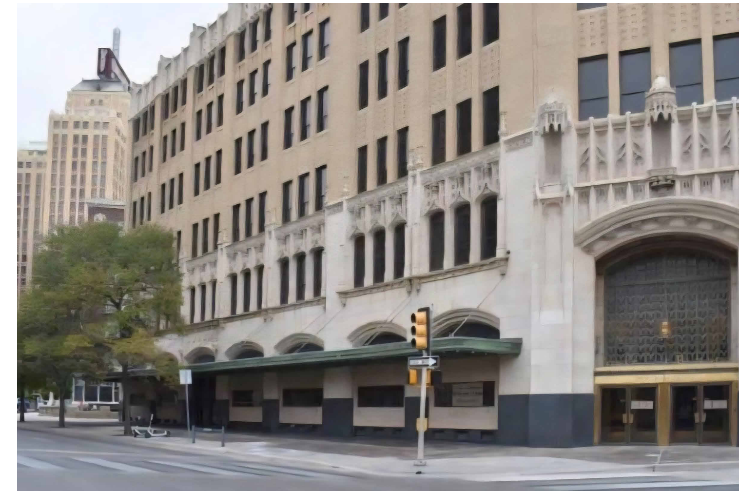
STREET LEVEL - SOUTHWEST VIEW