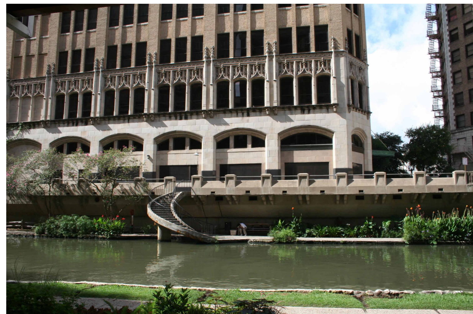
RIVER LEVEL - NORTH VIEW