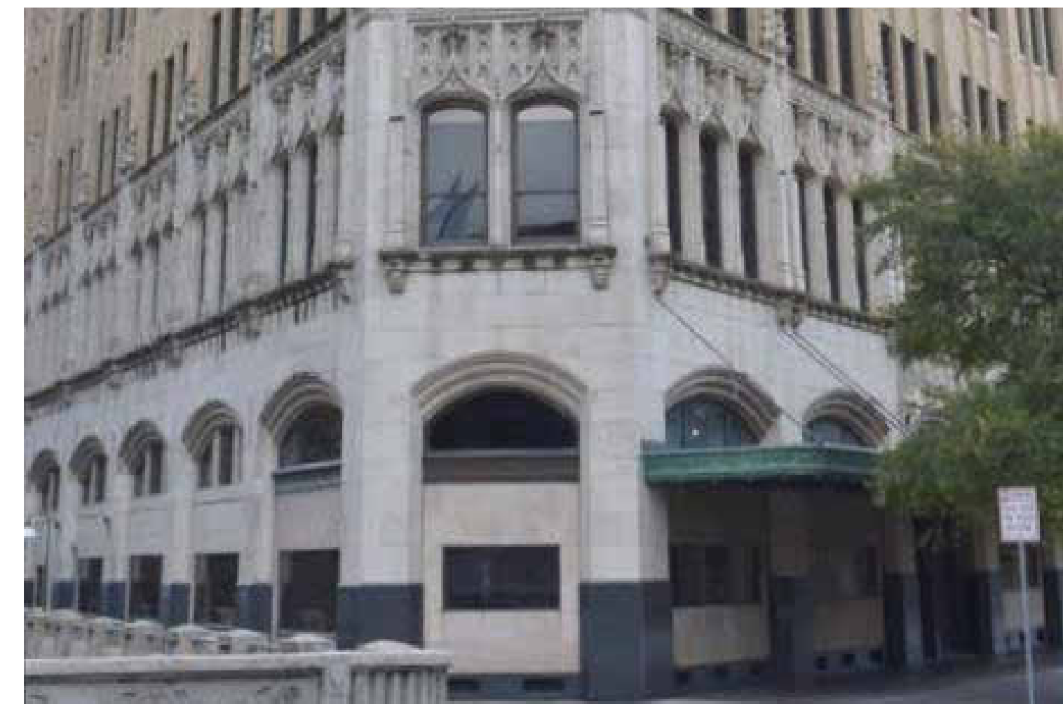
STREET LEVEL - WEST VIEW