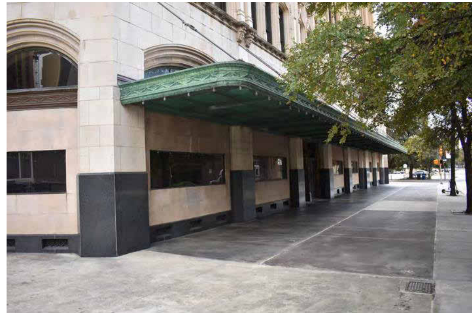
STREET LEVEL - NORTHWEST VIEW