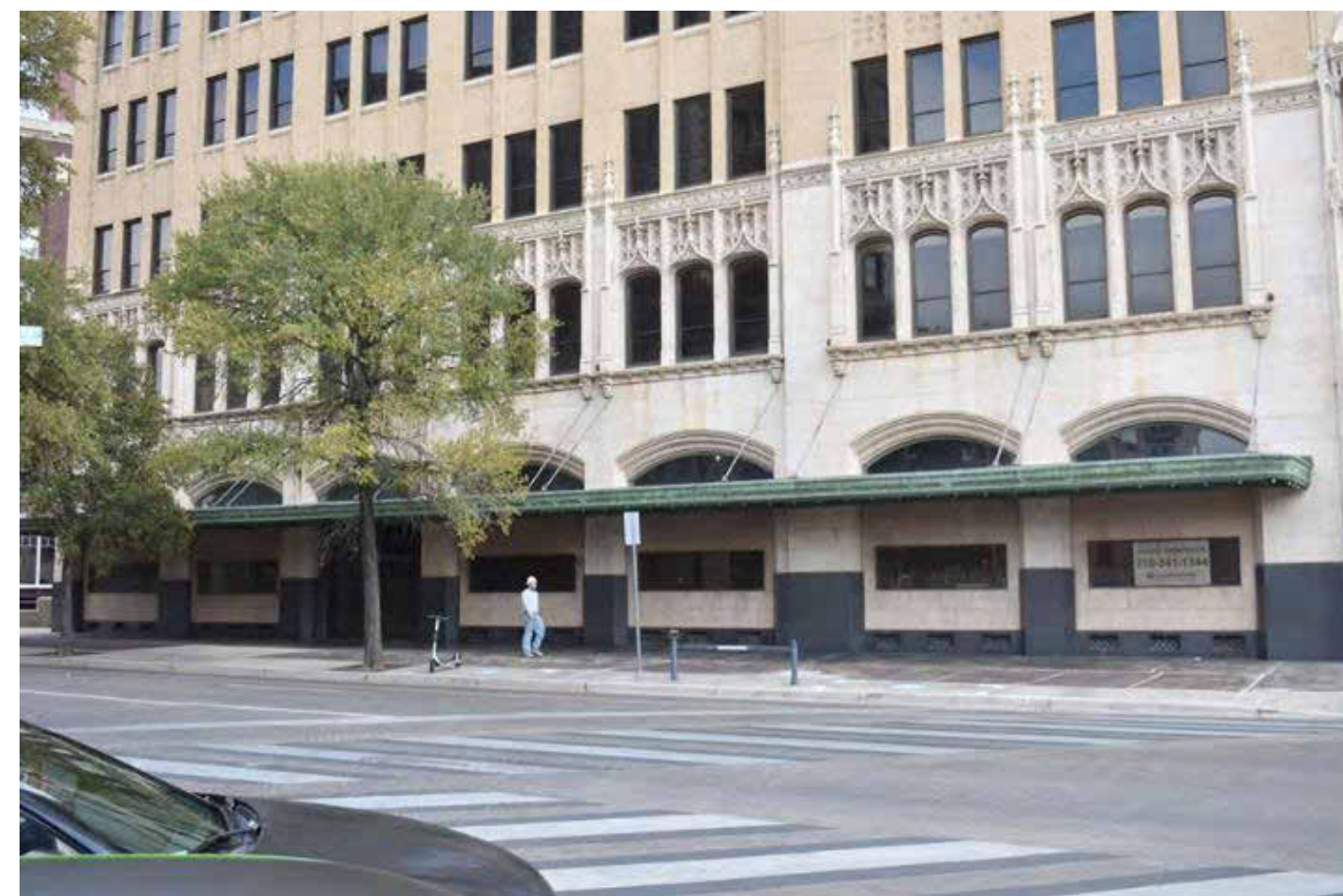
STREET LEVEL - WEST VIEW