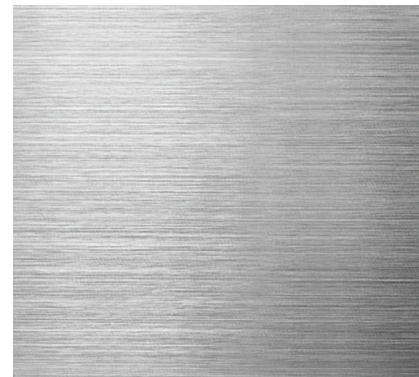
CLEAR ANODIZED ALUMINUM