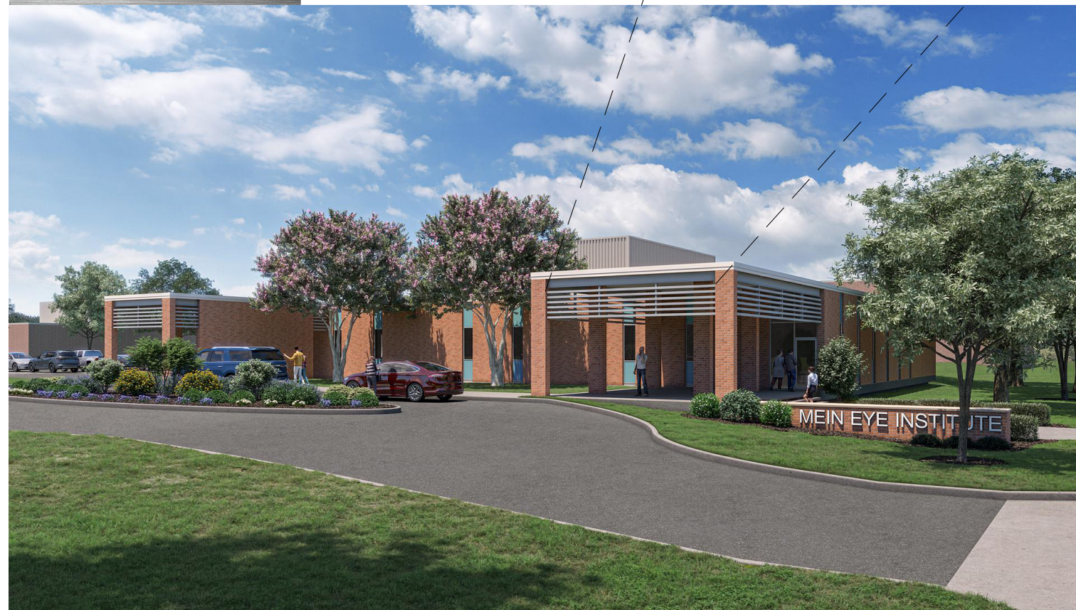
NEW INSULATED TINTED GLAZING