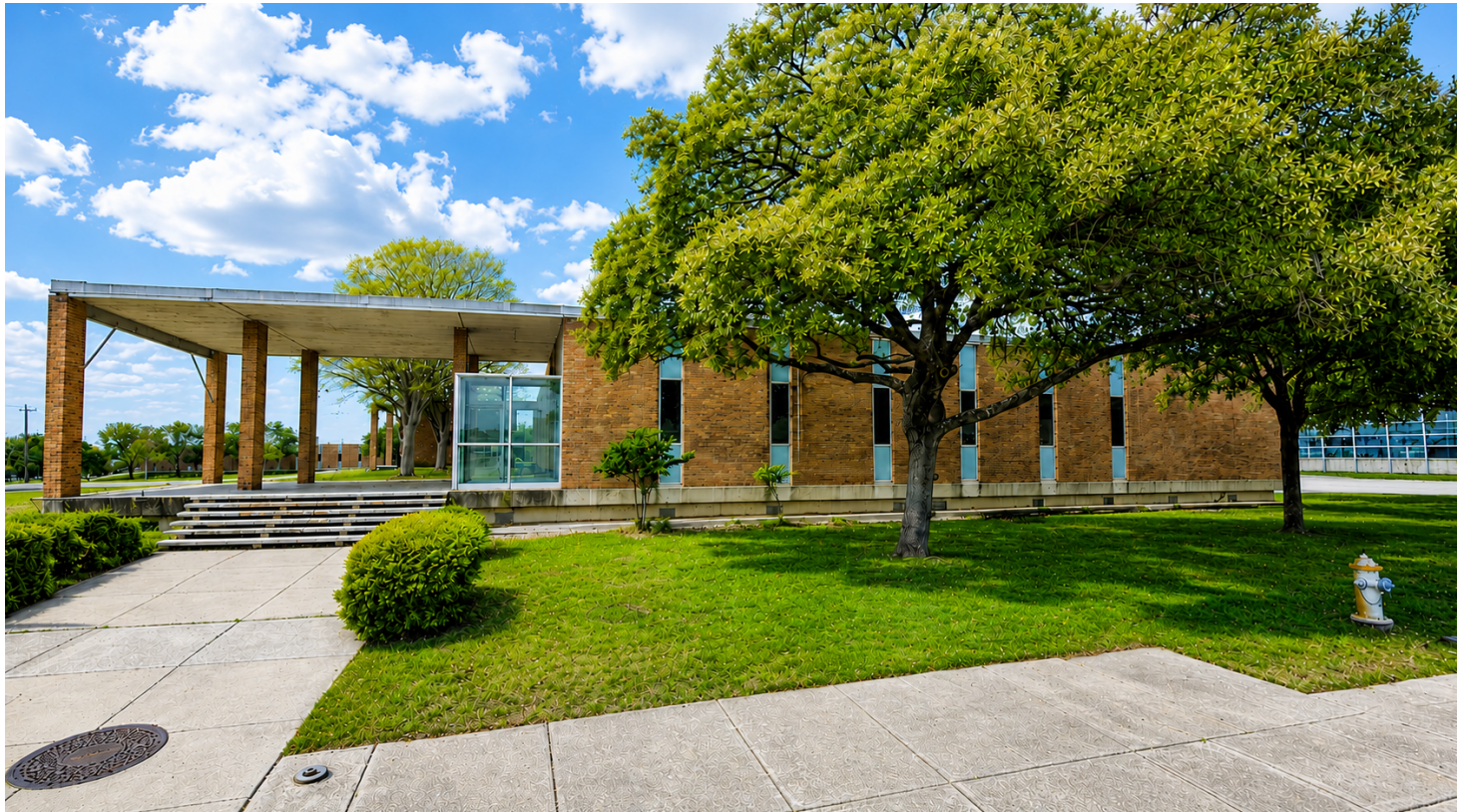
01-VIEW LOOKING SOUTH