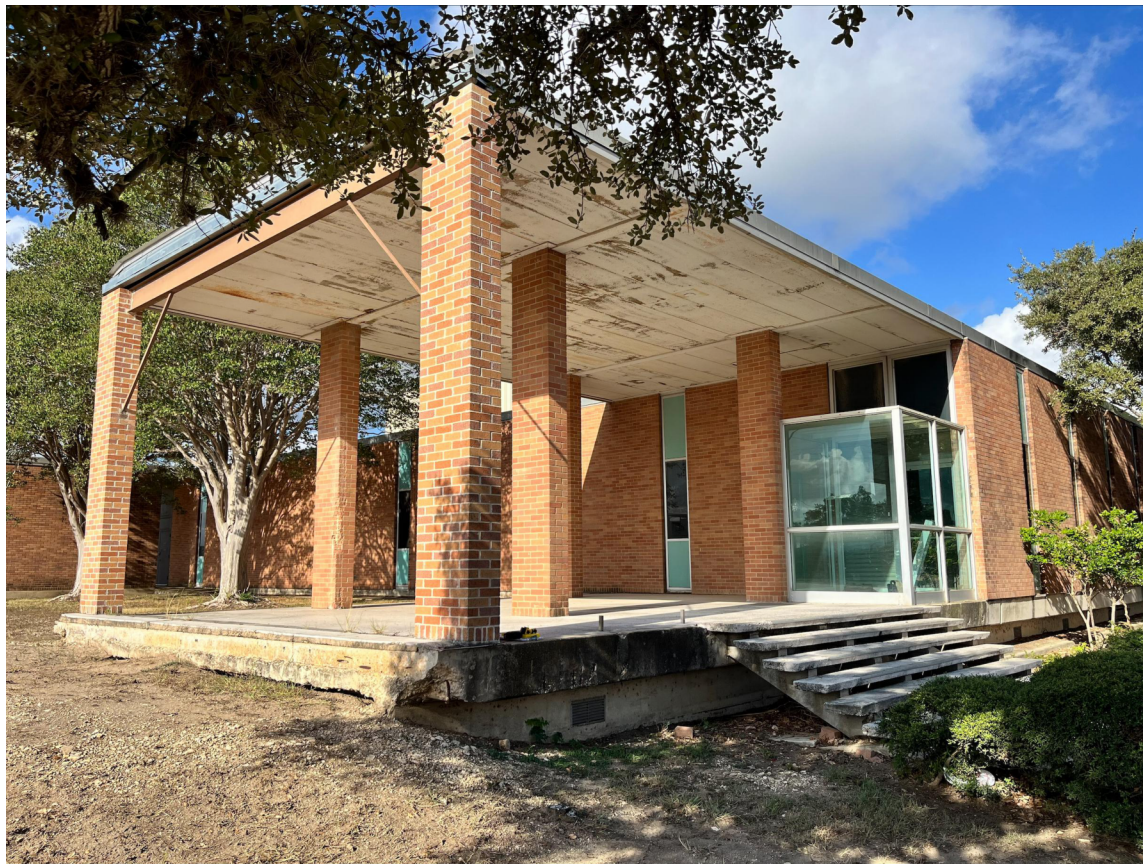
02 - MAIN ENTRANCE