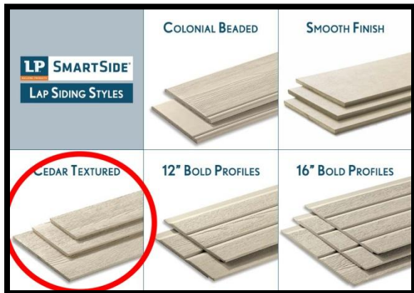
Lap Siding Cedar Textured 8.25" Reveal