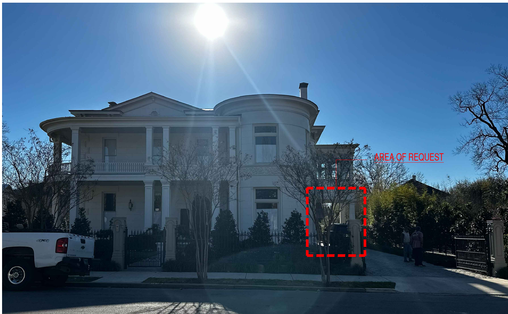
PHOTO: FRONT ELEVATION, KING WILLIAM ST